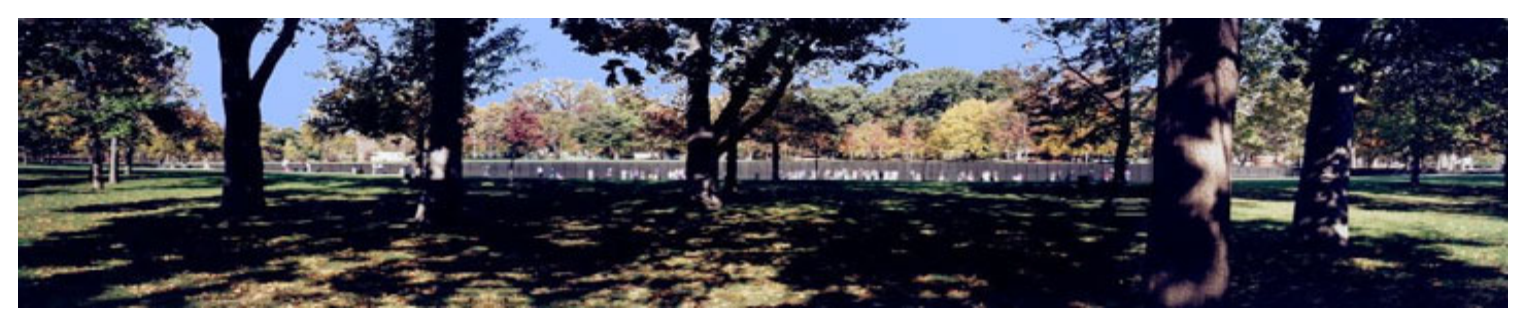
The National Vietnam Veterans Memorial, Constitution Gardens, Washington, D.C.

I was in Baltimore, Maryland to attend a seminar. Realizing that the memorial is only a short drive from Baltimore, I arranged my flight to arrive a day early to allow a whirlwind tour of Washington's memorials. Having visited <u>The Moving Wall</u> at Riverside's National Cemetery, I wanted to see the actual Vietnam Veterans' Memorial and two special names of killed-in-action buddies I served with, plus family names and cousins.