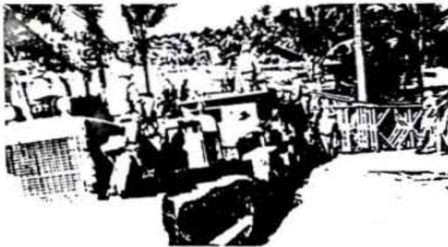
Tractor Assisting Truck in Sandy Area

The troops ashore moved quickly to join with the ARVN soldiers in a defensive perimeter and to their preplanned tasks. It was found immediately that there was insufficient construction area for the bridge. Sand had drifted into a dune almost 30 feet high, within 60 feet of the causeway exit, and would have to be dozed aside. No sooner had the work begun than it was discovered that the local inhabitants had used this area for burying their dead. Several interments had been made as recently as 30 days before the landings. Since pacification begins with respect for the feelings of the Vietnamese people, an orderly disinterment was sought. American soldiers worked with the ARVN to find the families concerned, and they were then paid to remove their deceased members. The engineers were annoyed by this delay but moved