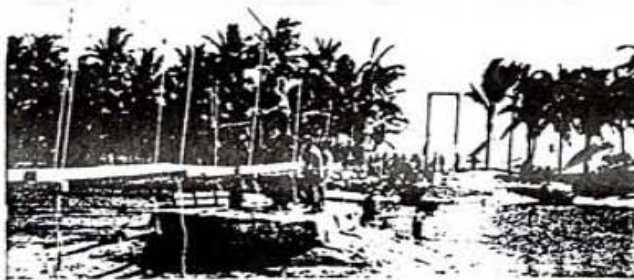
Engineers Working on the Suspension Footbridge

equipment and extricate itself from the beach, a message was radioed to Qui Nhon requesting LCU's be sent up the coast to complete the mission.