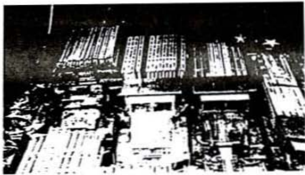
Loaded Bridge Trucks in Well Deck of LSD, Gunston Hall

ahead with what they could do. Fifteen-man assault boats were used to ferry panels out to the pier site and pier construction was begun. Cables were strung for anti-mine booms and M-4 balk were attached for floats. The layout crews went to the far shore and worked back toward the construction site with cribbing and rollers. Bridge equipage was stacked for quick access. Defensive locations were dug and a barbed-wire perimeter was strung. By the afternoon of September 16, the graves were all removed and dozing to open up the construction area began. As rapidly as the sand was pushed aside, the bridge assembly progressed.