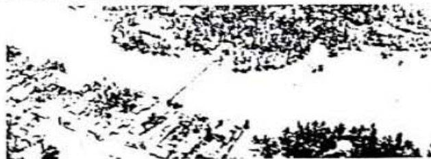
70-foot Bailey Bridge near Tam Quan

Operation DUKE was over. Another in an unending series of difficult engineer challenges in Vietnam had been met and overcome. With two days rest and retraining, the 509th Company moved north again on another bridging mission.