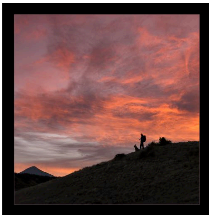
Kyle Alltop & (R)MWD Chrach