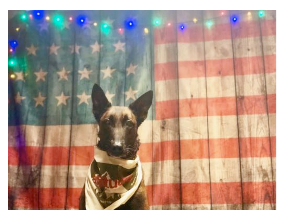
Merica! If you don't believe it ask MWD VVenice.