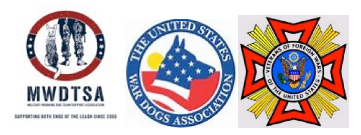
Feed the Dawgs Project 2018 Schedule The Dawgs Project http://thedawgsproject.com/index.html

Thank you to MWDTSA, U. S. War Dogs, and VFW Post 7539, Bloomingdale, Illinois for the "Care Packages" that are arriving to all of the kennels and K-9 troops that we support in Southwest Asia. You guys are just damn awesome. Thanks for your continued support.