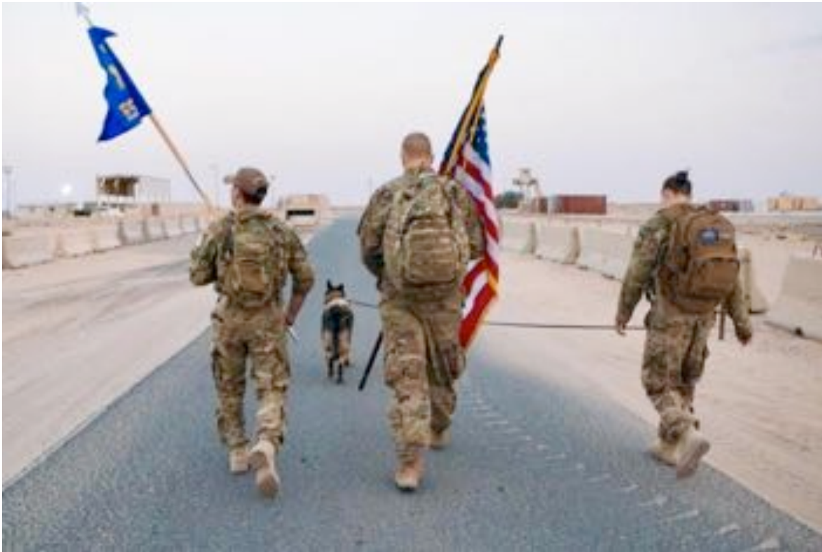
MWD Aruba knows if you're not first you're last! 9/11 ruck with K-9 leading the way!