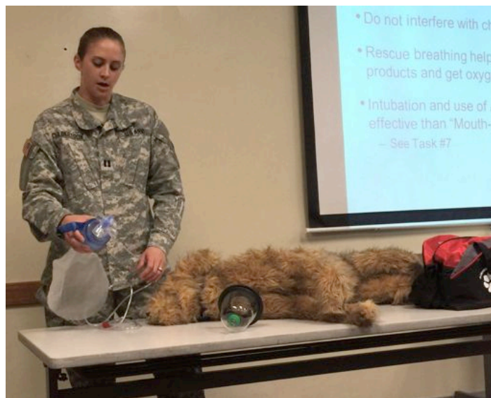
Team Kadena Air Base

Shipments to new units and locations will start in 2016. Thanks Air For Paws for your commitment and caring to make this program so successful. In ten months, Air For Paws and Old Dawgs & Pups have shipped 310 Units to 95 locations worldwide. We will attack the USMC during 2016 – Semper Fi! It's going to be a great year and we're ready to roll!