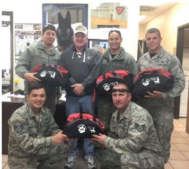
Team Dyess AFB

879 th ESFS Shaw AFB Luke AFB Kadena AB Ramstein AB Eglin AFB RTC Ft. Bliss Hill AFB Offutt AFB Scott AFB Beale AFB Buckley AFB Dover AFB Kennel/Hold Holloman AFB Ft. Rucker Anderson AFB Ft. Benning Ft. Lee