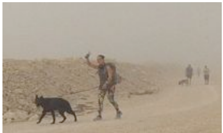
MWD teams joined in on the fun also!