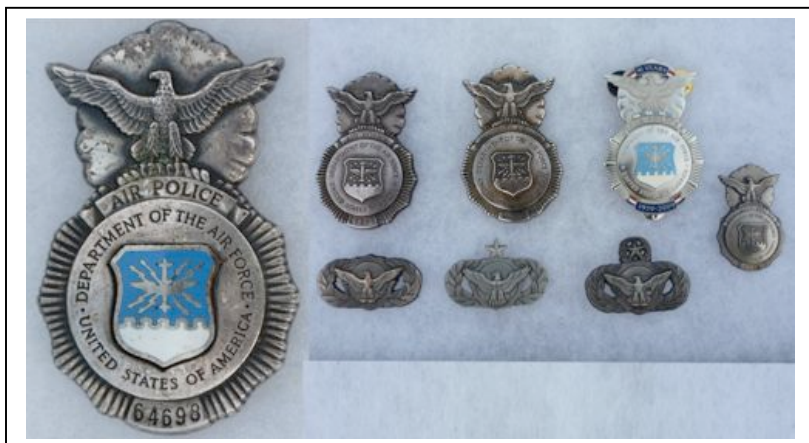
First Prize Picture