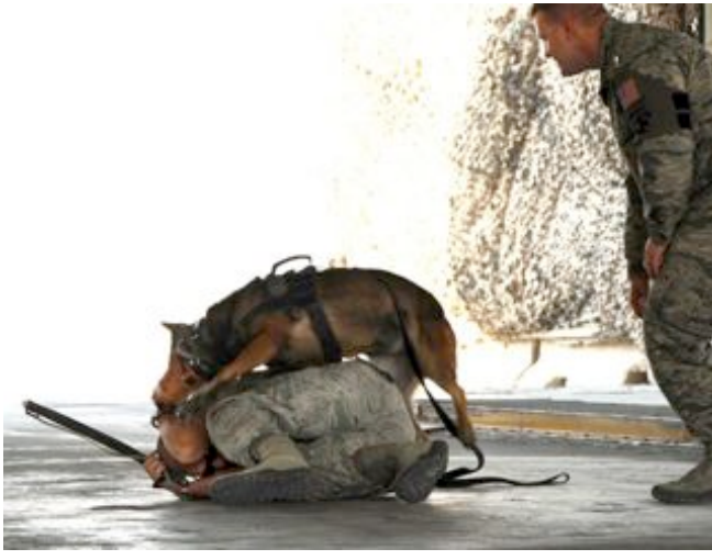
SSgt Jeremy Hayes & MWD Toki search a vehicle during route patrol and then they "unload" on SSgt Travis Beatty during muzzle controlled aggression training. The team is supported by Doc Hodges.