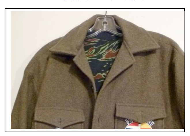
Third Prize Picture