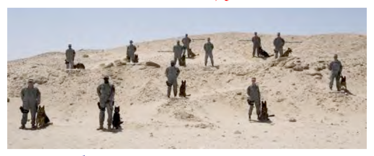
Members of the 379<sup>th</sup> ESFS, Al Udeid Air Base and their canine partners line up in the sand for this photograph. It's not a close up – but it sure shows some great dog teams!