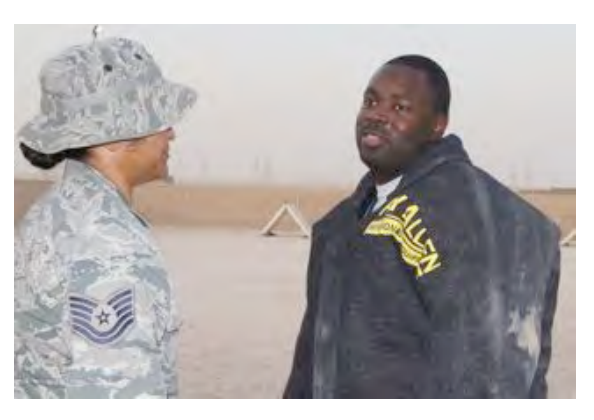
The K-9 Section recently put on a demonstration for 379<sup>th</sup> Medical Group – here's a overview.