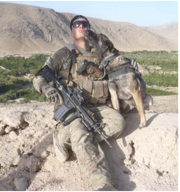
Does everyone remembers these moments?