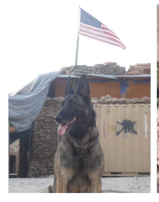
MWD Tosca "guards the flag"