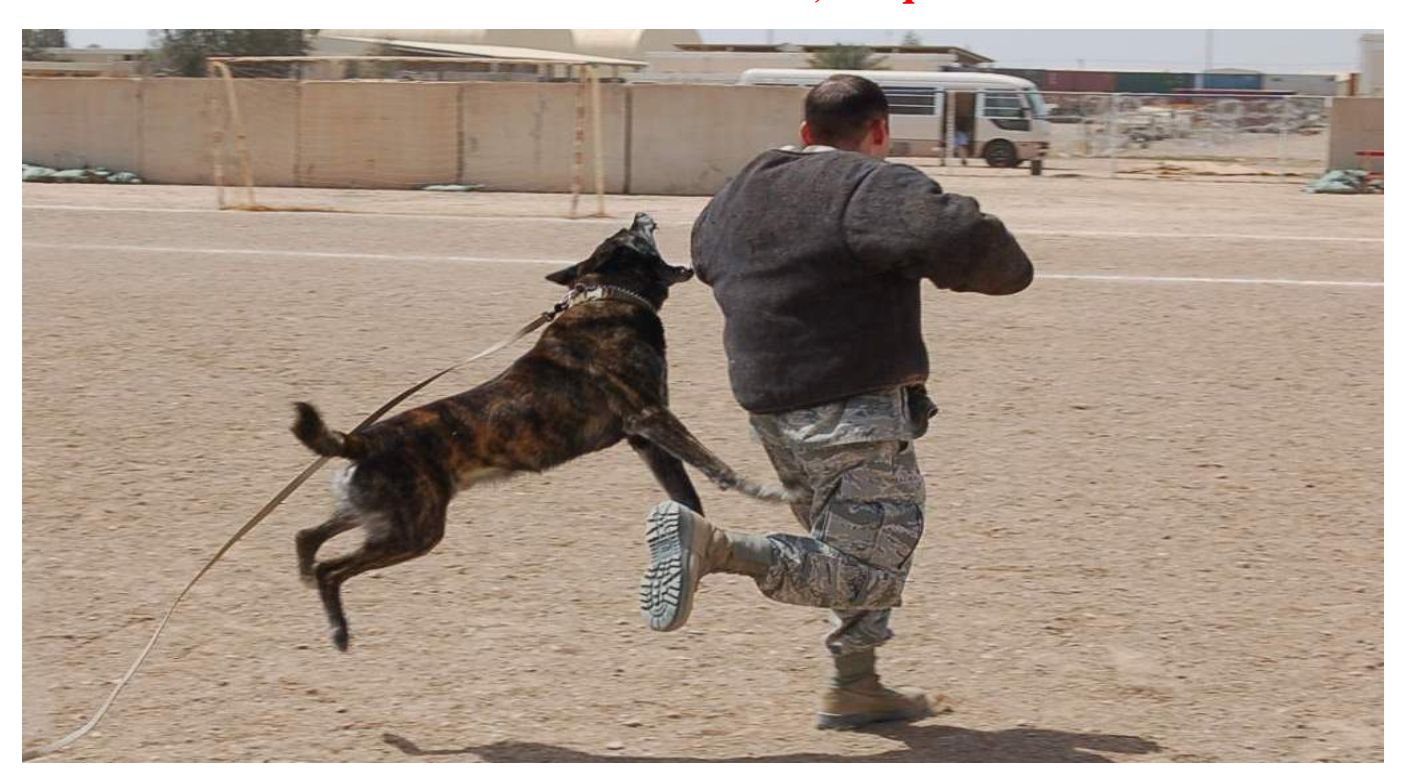
Looks like Rambo is going to draw "First Blood"!