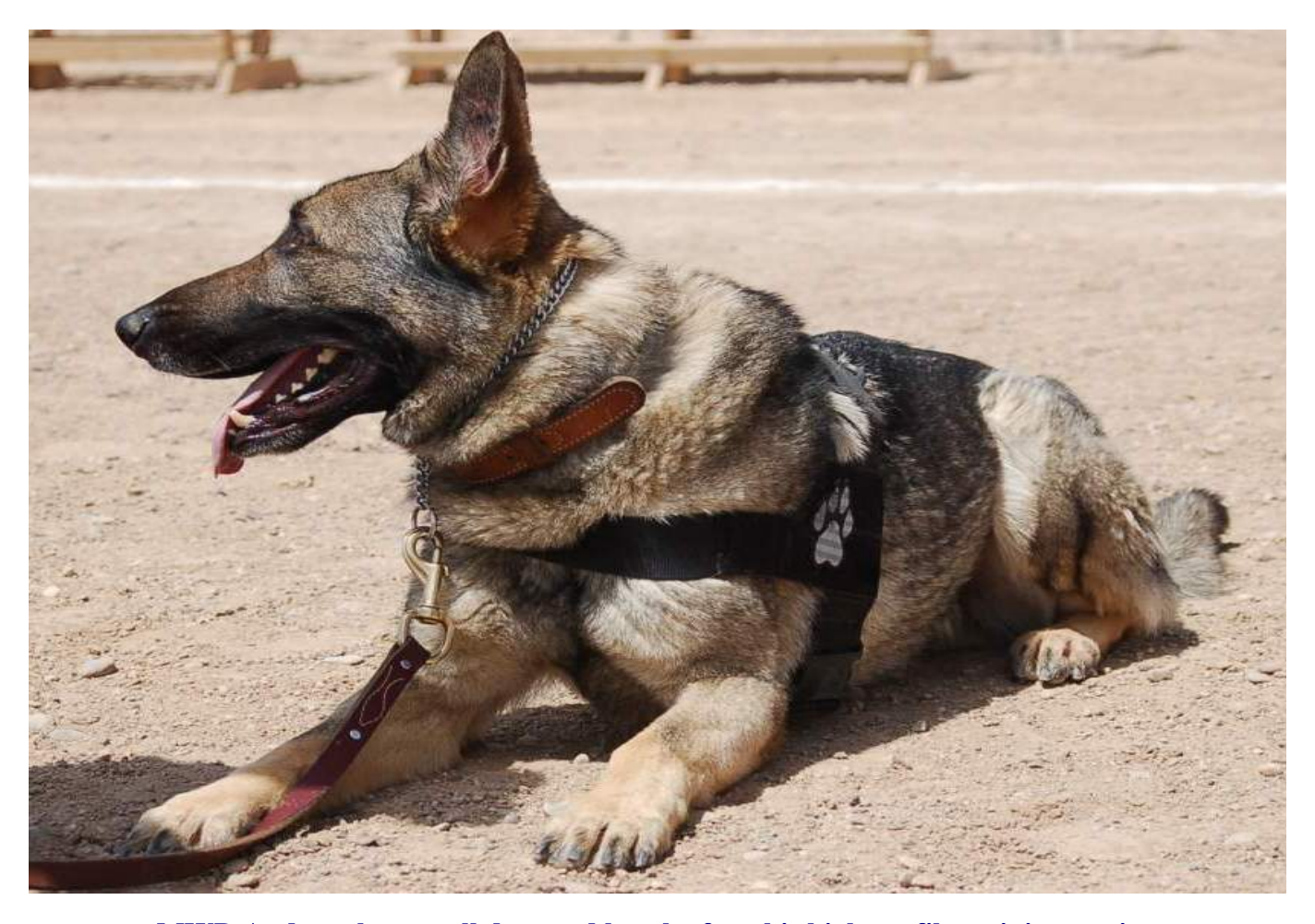
MWD Andor takes a well deserved break after this high profile training session