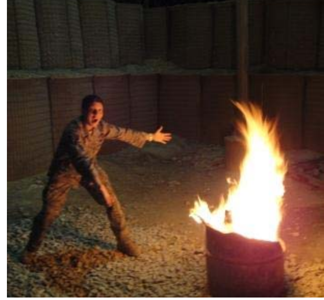
Above Left - "Holiday Inn Bagram"?