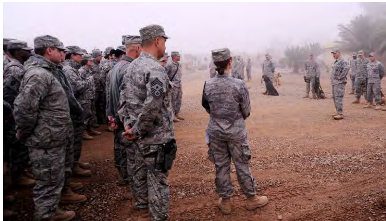
Adored by All