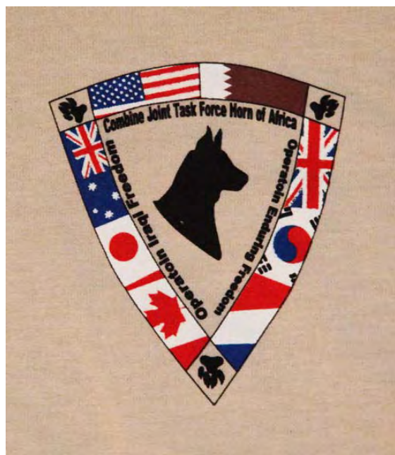
Front of Shirt