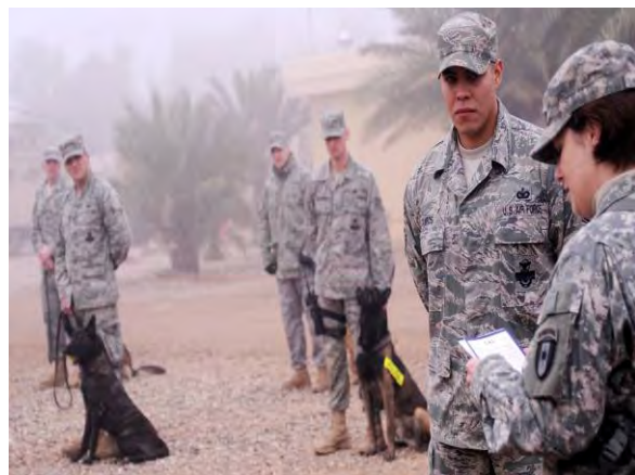
Loved by All