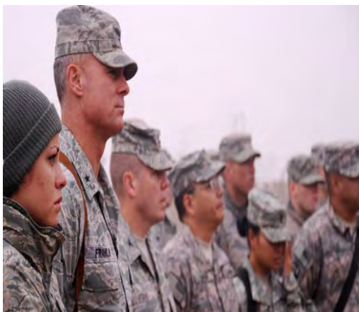
Respected by All