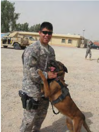
Always Mission Ready