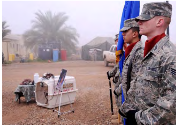
Honored by All