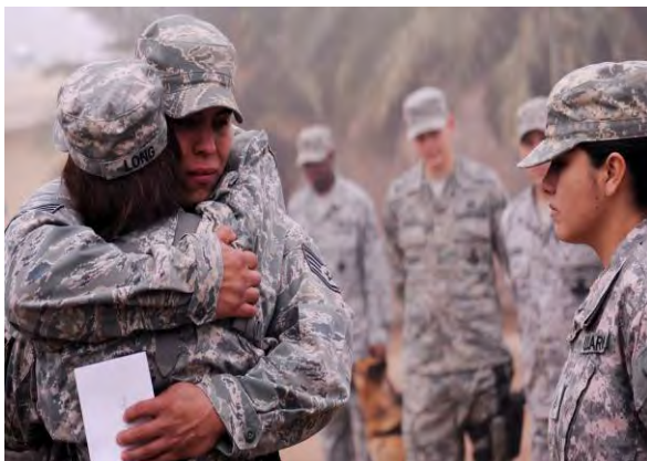
Missed by All