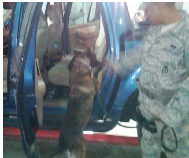
Diesel in a blur!