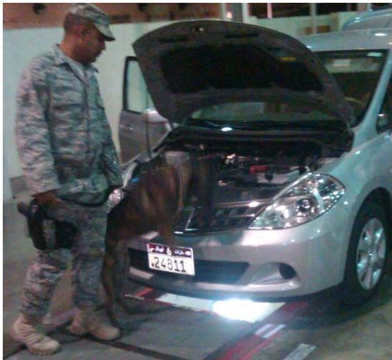
Diesel under the hood!