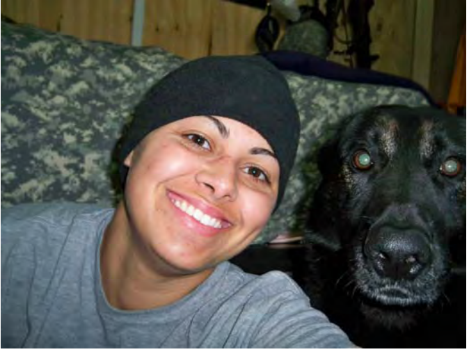
Look at that face – I mean look at those faces!