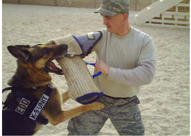
Just some good old fashion "attitude adjustment" training!