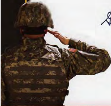
Pete Geren Secretary of the Army

A handwritten signature in black ink that reads "Pete Geren".