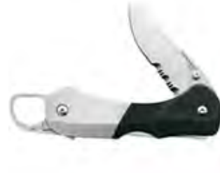
e55 "Expanse" Knife