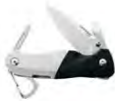
e33T "Expanse" Knife