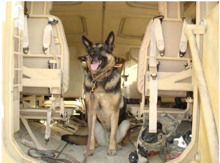
Iraqi “Car Alarm” MWD Sinda