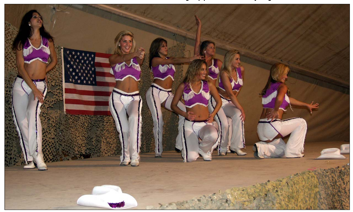
The cheerleaders finish their dance routine to 'Hit Me With Your Best Shot' during Tuesday's AFE-sponsored show.