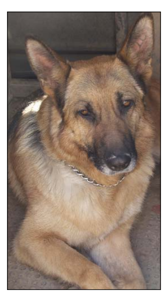
Exa relaxes in her portable kennel after a long work day.