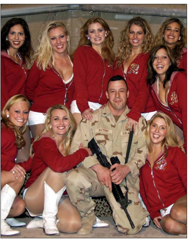
Members of the Washington Redskins cheerleaders pose for a group photo with an Army sergeant after the show.