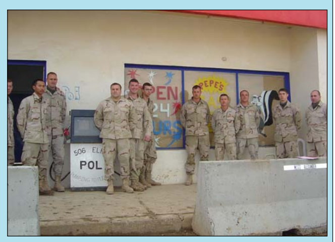
Members of the fuels shop stand for a group photo.

"Air Expeditionary Force Blue had some problems getting enough fuel, but the Army now delivers to us, and sometimes we actually get too much and we don't have room to store the excess," he said. "We have fuel bladder farms that look like giant pillows and the Iraqi system that has below ground tanks. However, the Iraqi system is for storage only as it has no pumping capability. The Air Force has mobile pumps to siphon the gas out of the Iraqi tanks when required."