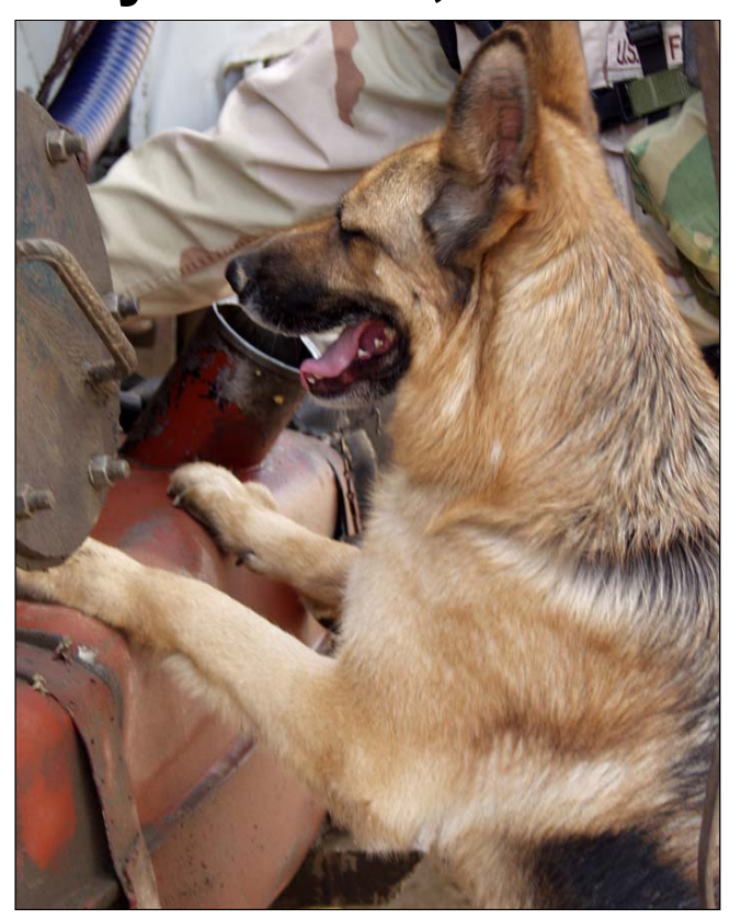
Exa, a military working dog for the 506th Expeditionary Security Forces Squadron, checks a vehicle during a routine inspection recently.

"Occasionally we've found things from remote-control parts, various