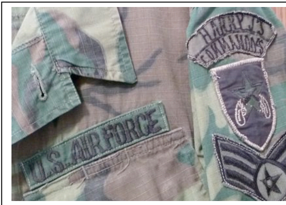
First Prize Picture