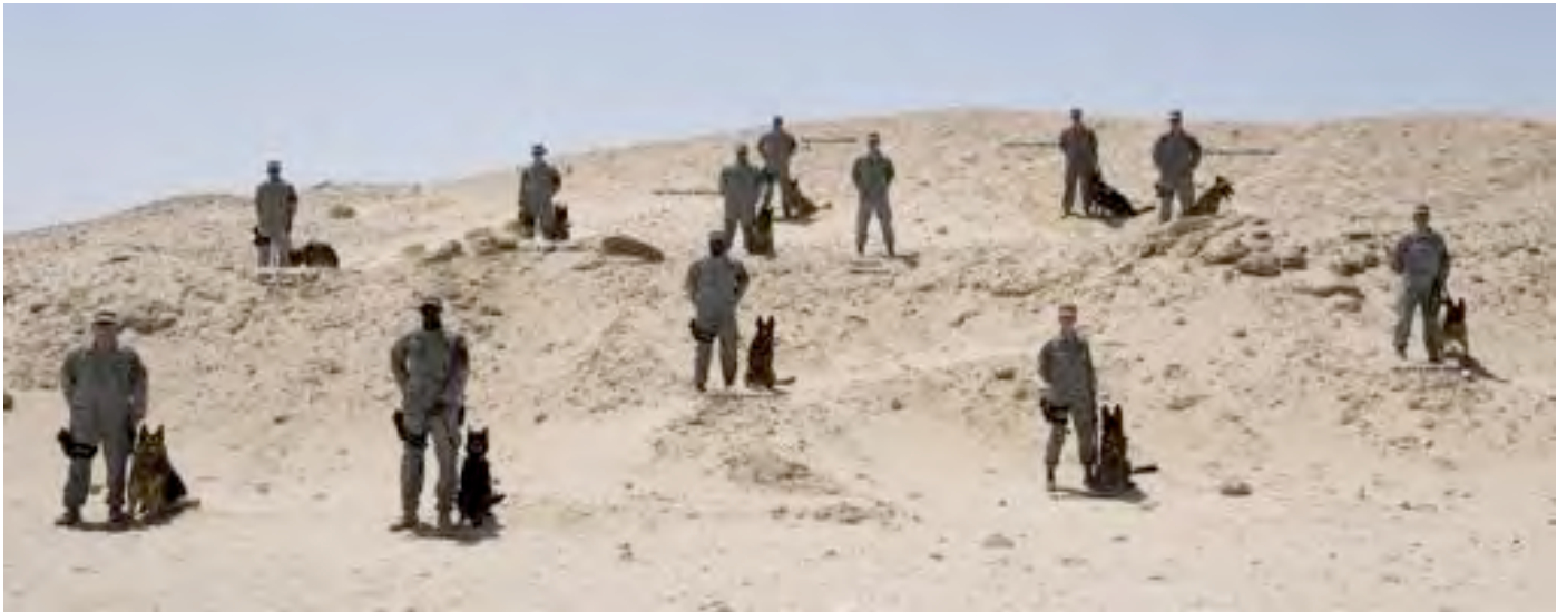
Members of the 379 th ESFS, Al Udeid Air Base and their canine partners line up in the sand for this photograph. It's not a close up – but it sure shows some great dog teams!