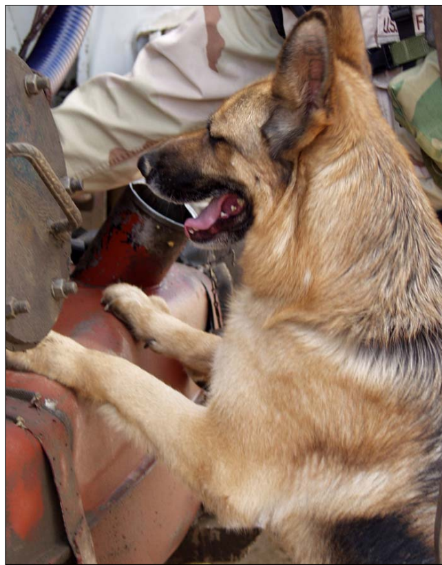
Exa, a military working dog for the 506th Expeditionary Security Forces Squadron, checks a vehicle during a routine inspection recently.

"Occasionally we've found things from remote-control parts, various