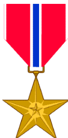
Bronze Star medal

practice to stop listening when someone starts off any conversation with "back when it was hard."