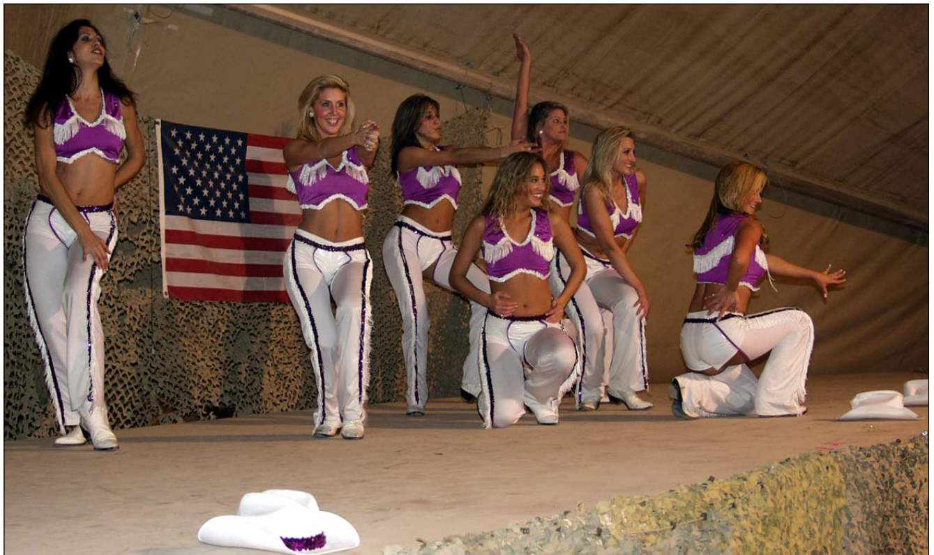
The cheerleaders finish their dance routine to 'Hit Me With Your Best Shot' during Tuesday's AFE-sponsored show.