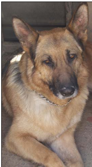
Exa relaxes in her portable kennel after a long work day.