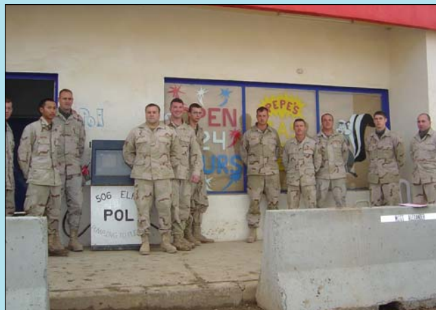
Members of the fuels shop stand for a group photo.

"Air Expeditionary Force Blue had some problems getting enough fuel, but the Army now delivers to us, and sometimes we actually get too much and we don't have room to store the excess," he said. "We have fuel bladder farms that look like giant pillows and the Iraqi system that has below ground tanks. However, the Iraqi system is for storage only as it has no pumping capability. The Air Force has mobile pumps to siphon the gas out of the Iraqi tanks when required."