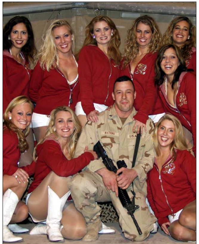
Members of the Washington Redskins cheerleaders pose for a group photo with an Army sergeant after the show.